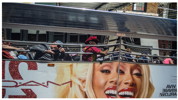
From the 15 slide series of reflections "Sometimes I shoot myself". Slide title - "Behind Sherwood".