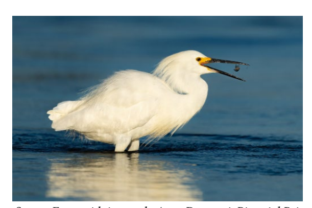
Snowy Egret with its snack. Anar Daswani, Pictorial Print