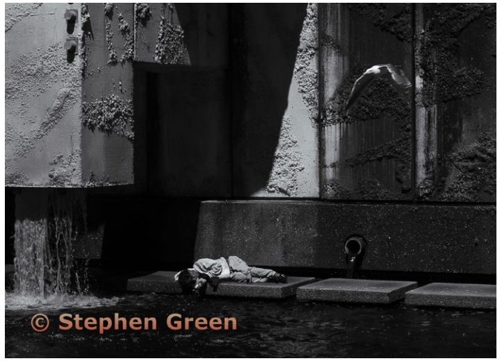
Past Winning PJ Image by Steve Green

Special Interest Group - Bird Photography