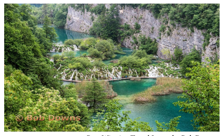
Past Winning Travel Image