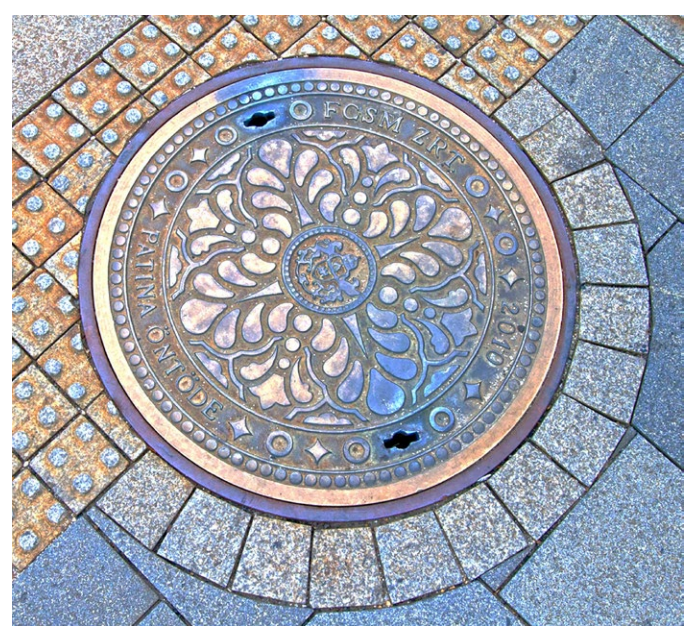
The combination of a complementary palette and geometric lines are pleasing to my eyes. Budapest, Hungary, Image by Richard Ingles