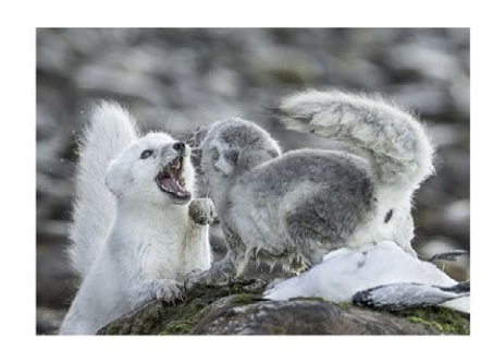
The Defense. A juvenile Arctic Fox defends his pray (a Kittiwake) from an adult Arctic fox after picking it up from the water in Svalbard.- Kelly Zhang, Nature Projected ▶

This juvenile Arctic Fox seemed to have come in like lightening from far away, jumped into the water, and pulled the dead kittiwake ashore. Another adult Arctic Fox tried to steal it and the juvenile fought a fierce battle to guard his prey. Whoever wins will survive the bitter cold Arctic winter.