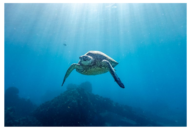
Sea Turtle at the old Mala boat ramp off Lahaina, Maui.