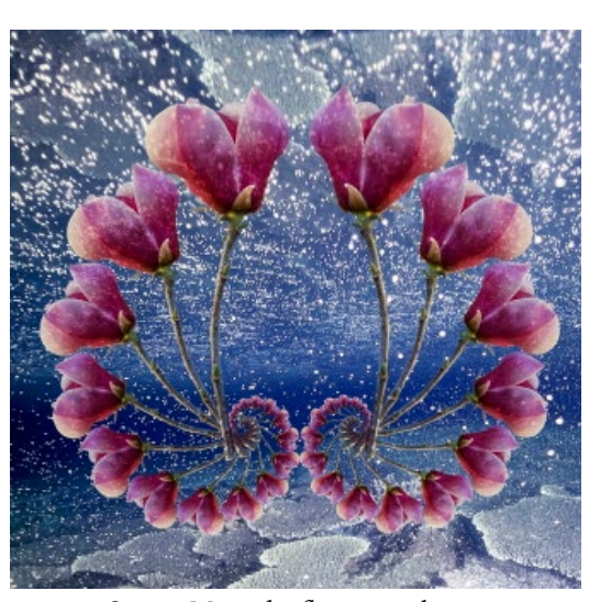
Saucer Magnolia flowers in the sea, Serena Hartoog, Creative Projected