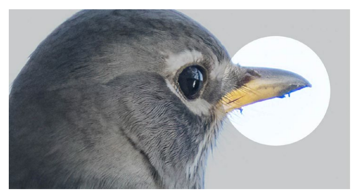
Chromatic Aberration - Color Fringing, aka purple fringing

Chromatic Aberration. Also called "color fringing," this is a color distortion that occurs when a lens fails to focus all colors to the same point. It appears as an outline or fridge of color in areas of an image where there is high contrast between light and dark objects.