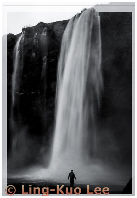
Standing in front of the Skógafoss Waterfall in Iceland, Ling-Kuo Lee, Monochrome Print