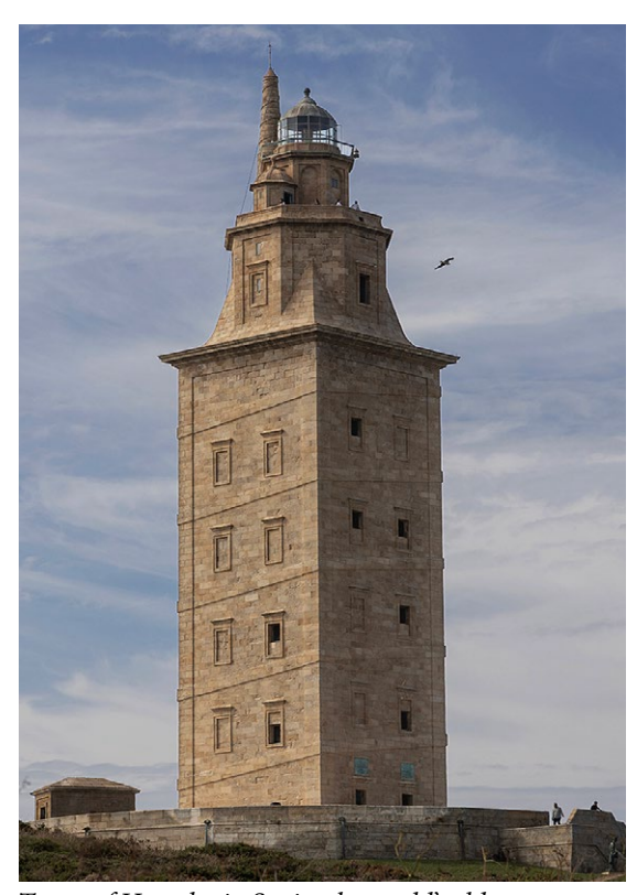
Tower of Hercules in Spain, the world's oldest active lighthouse, built by the Romans in the first century.

On October 16th, eight members of the club each showed 15 images featuring a general theme of their choice. The program was organized and moderated by Airdrie Kincaid and about 30 members attended the event. You can view the recording of the image presentations on our website by looking at programs on the website.