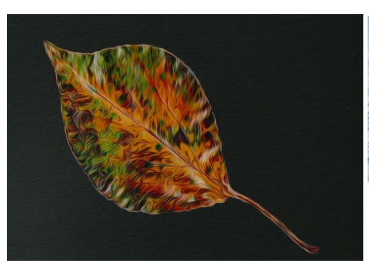
Psychedelic Leaf. Harvey Gold, Creative Print